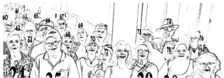
Enlargement of upper right section