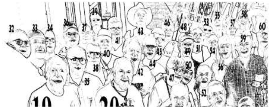
Enlargement of upper left section