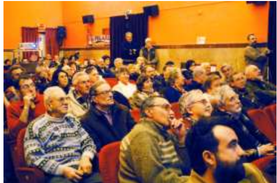
The audience at the Nacchere Toscane CD Release Event