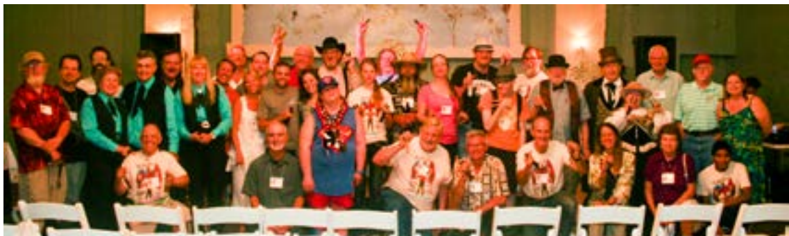
Bones Fest XVIII Attendees at Guest House in Grand Rapids, MIv (See Page 6 for the key to attendees names)