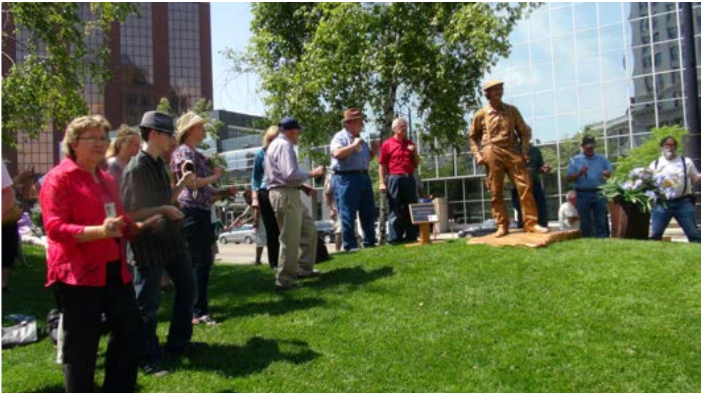
Flash Mob centered around Matt 'Celtic' Kilroy, a frozen bronze statute, on the knoll at Rosa Parks Circle in downtown Grand Rapids