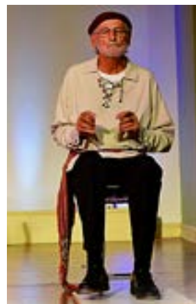
Bob Goulet sitting and playing and dancing