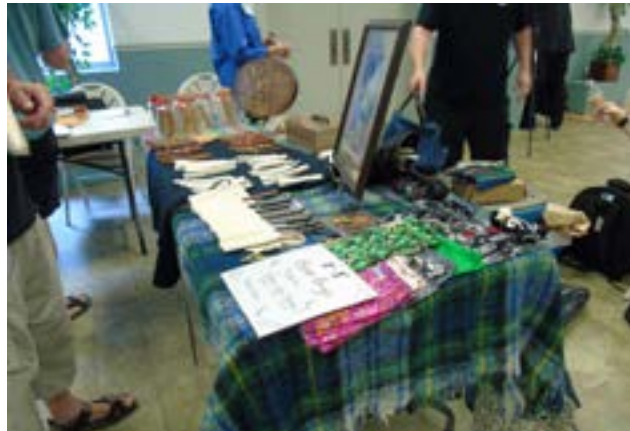
One of several Rhythm Bones Marketplace tables