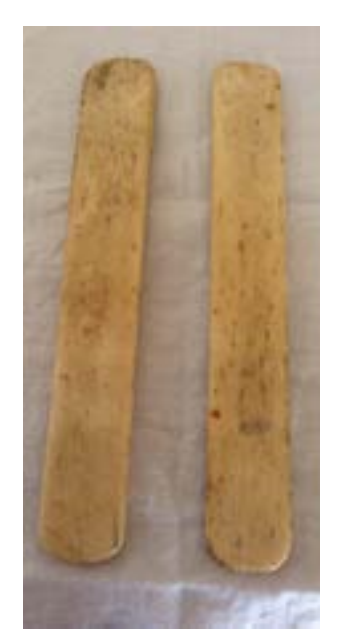
WWI Rhythm Bones - See Page 6