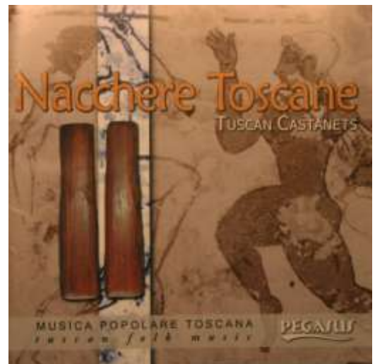
Front cover of CD lines notes booklet. See Page 3