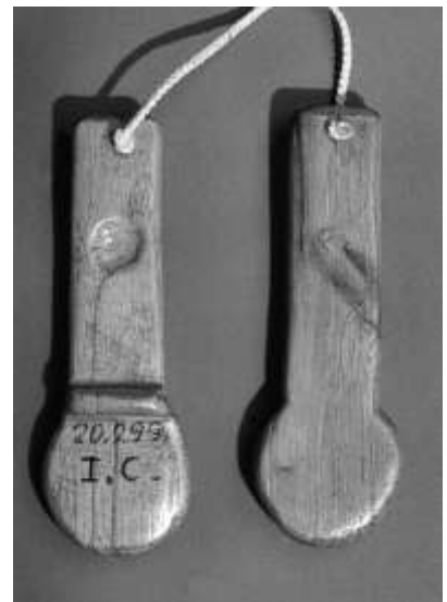
Bay oak wood. Manufactured by I. Corti.