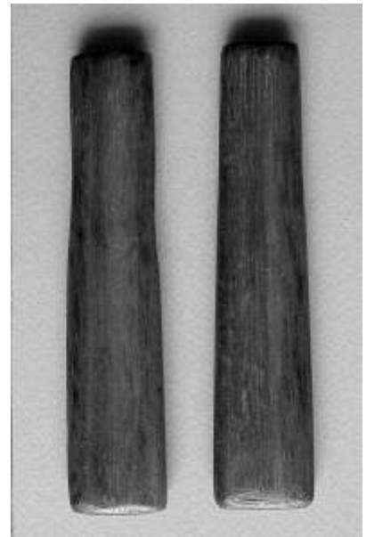
Traditional shape, oak. Manufactured by C. Barontini.

Idiophones of this type made of diverse materials (wood, tortoiseshell, bone), but shaped in a similar way, are common in the Middle East, in Africa and North America. Imported perhaps by Irish immigrants in the United States, the flat nàcchere (bones) were made principally of bone and their use