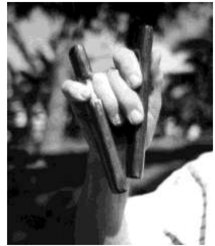
Some type of castanet handles and their position. The castanet on the right is the “fixed” while the woodpiece on the left is the “movable” one. Upper left photo is the “classic handles”. Lower right photo: the ‘triple castanets’, an idea by Ido Corti.