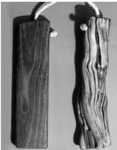
Oak (left), rosemary (right). Manufactured by I. Corti.

is documented until the end of the 1800s when they became used exclusively in Minstrel Shows, in Vaudeville, and generally in many Afro-American forms of music, from the blues to jazz (especially in the style of New Orleans). These instruments are still widely used both in folk (blues and country) and in other musical forms for which there are special organized events (concerts, exchanges of experience for constructing the instruments, and seminars).