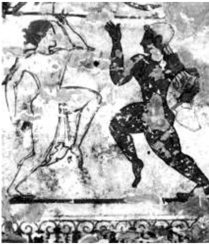
Tarquinia, "The lioness tomb" (VI century b.C.). The dancer on the left holds a pair of castanets (crotala).

ered with leather, with the opening of the pots covered in animal hide which are played with two sticks, hitting alternately one or the other of the two instruments, now called taballi, and timballi which were mostly in use among the Saracens."